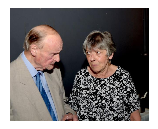
(This looks like a press release shot from a dodgy play!)