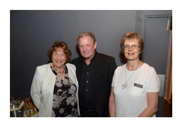
All smiles! We like to mingle...