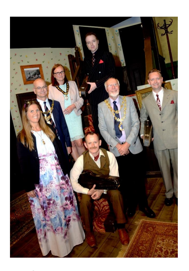
Meeting the cast